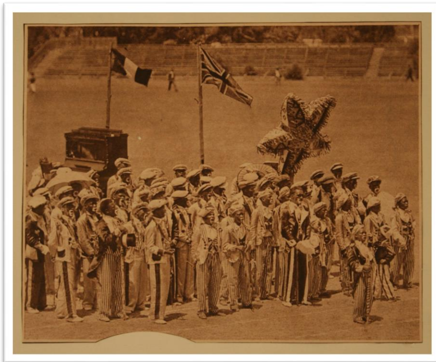
Cape Town ‘Minstrel Troop’ from 1933 – Much training and planning is involved in creating a minstrel parade.